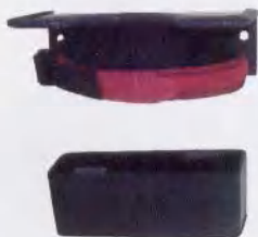
Cutters & Combi Brackets